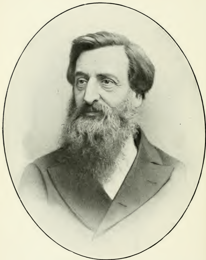
WILLIAM BOOTH (1879)